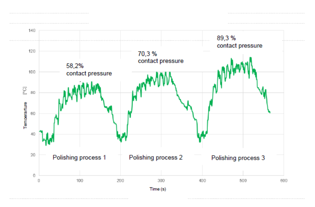
Figure 1 Temperature development in the robot cell during three polishing cycles with 10 passes each and different contact pressures

The robot system in the Menzerna technical center can accept work pieces of any kind and, with "inline measuring technology" that ac-companies the process, take exact and reproducible measurements of the work piece temperature – for example depending on the con-tact pressure.